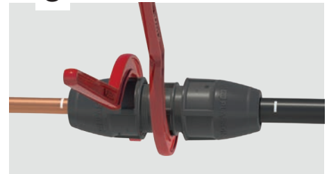
Tighten the nut