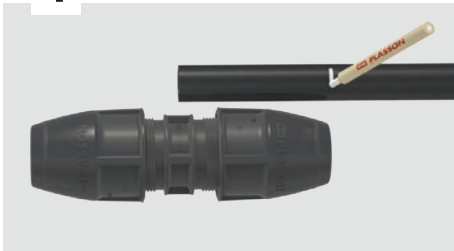
Mark pipe insertion depth