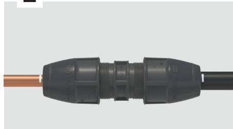
Insert the pipe